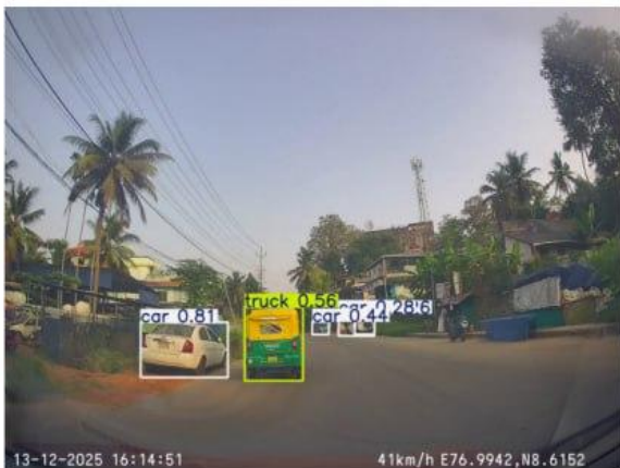
frame_use1_0004.jpg Detections: 5