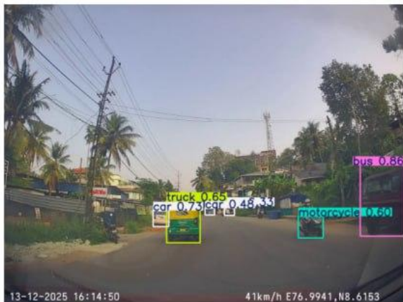
frame_use1_0003.jpg Detections: 6