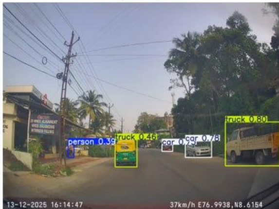
frame_use1_0000.jpg Detections: 6