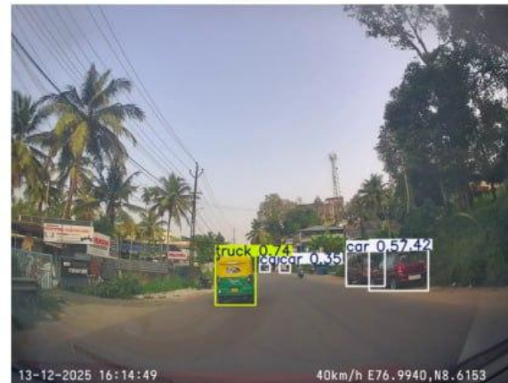
frame_use1_0002.jpg Detections: 5