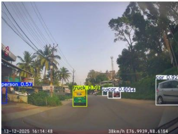
frame_use1_0001.jpg Detections: 6